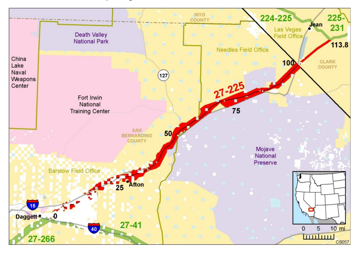
Figure 1. Corridor 27-225

Corridor 27-225 (Figures 1 and 2) extends from the junction of Corridors 27-41 and 27-266 near Daggett, CA, to the intersection of Corridors 224-225 and 225-231 in the southern part of Clark County and south of Jean, NV. Federally designated portions of this corridor are entirely on BLM-administered land, with a 10,560-ft width in CA and a 3,500-ft width in NV. The corridor follows a previously designated corridor in California but uses the default 3,500-ft width in Nevada, where it was not designated. Corridor 27-225 is designated as multi-modal and can therefore accommodate both electrical transmission and pipeline projects. The corridor spans 113.8-miles, with 83.8 miles designated on BLM-administered lands. The corridor's area is 106,603 acres or 166 square miles. This corridor is in San Bernardino County in California, and Clark County in Nevada and under the jurisdiction of the BLM Needles and Barstow Field Offices in California and the Las Vegas Field Office in Nevada. The corridor is also entirely in Region 1.